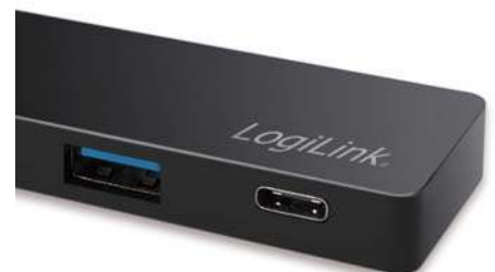
USB3.1 Gen1 port