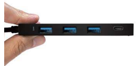
1cm Ultra-Slim thickness