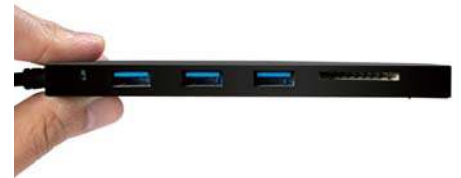
1cm Ultra-Slim thickness