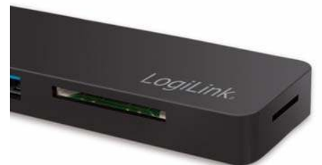
Support two memory cards at the same time