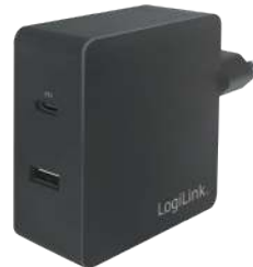
PA0213 USB-C™ 2-Port Wall Charger