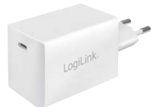
PA0229 USB-C™ GaN Wall Charger