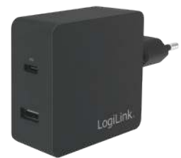
PA0212 USB-C™ 2-Port Wall Charger