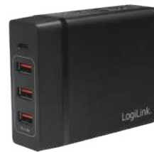
PA0122 USB Table Charger