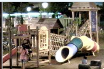
VIVOTEK SNV Camera