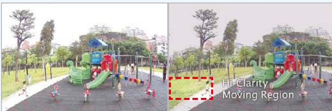
Without Smart Stream II