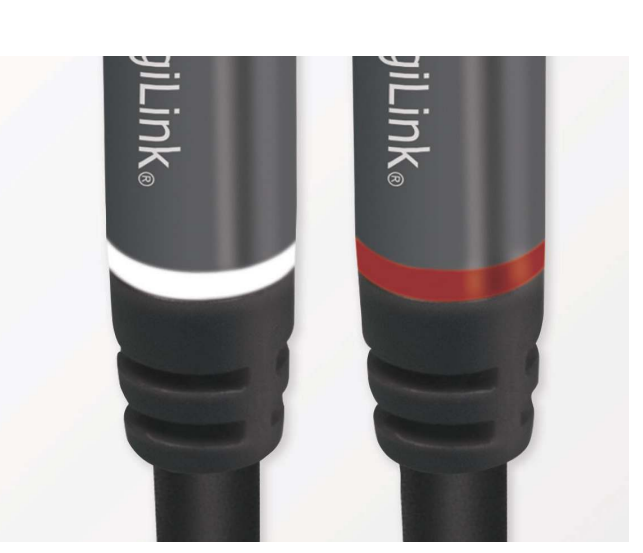
Color Code Rings For easy polarity identification.