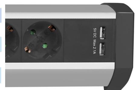
2 USB charging ports