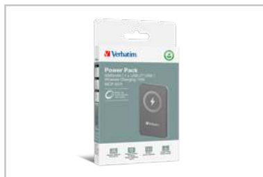
32244 - Packaging 3D