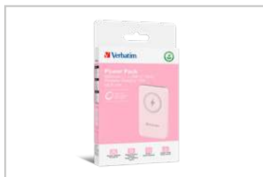
32243 - Packaging 3D