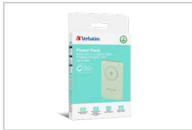
32241 - Packaging 3D