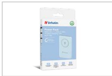
32242 - Packaging 3D