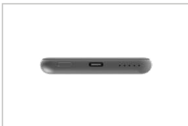
32244 - Front Angled