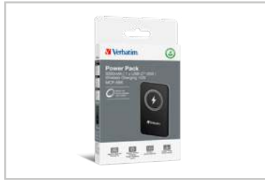
32240 - Packaging 3D