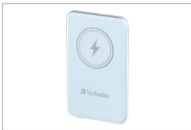
32242 - Front Angled