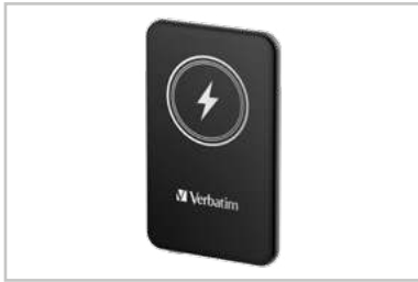
32240 - Front Angled