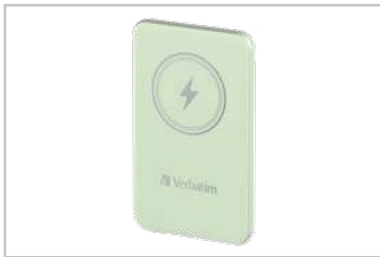
32241 - Front Angled