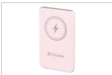
32243 - Front Angled