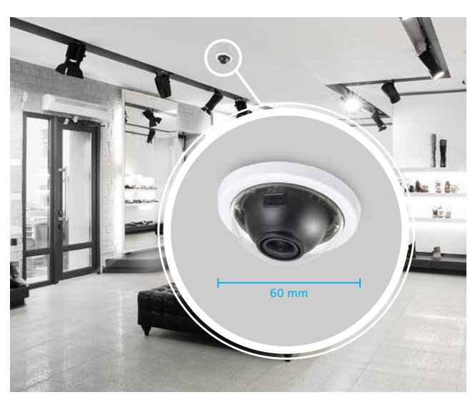
Ultra-mini Recessed-Mount Fixed Dome Network Camera