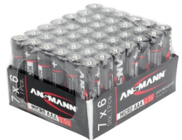
42pcs carton box (7 x 6 pcs shrink)

42pcs box dimensions: 75 x 65 x 46 mm weight (incl. batteries): 480 ± 20 g