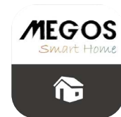
Megos Smart Home

Download the free APP from the App Store or Google Play store.