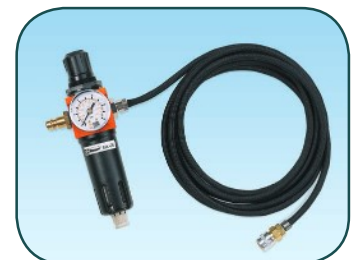
Pneumatic Tool Accessories