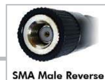
SMA Male Reverse