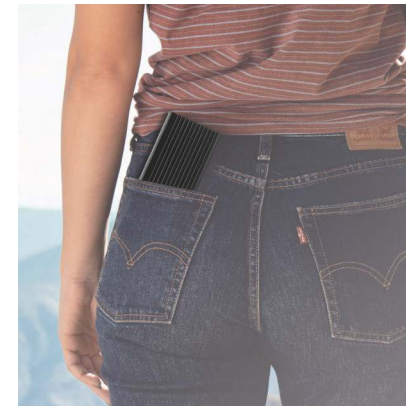
Pocket Size and Easy to Carry