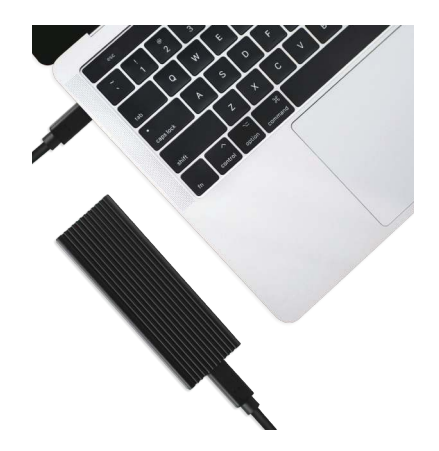
Plug and Play