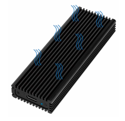
Heat Dissipation Design