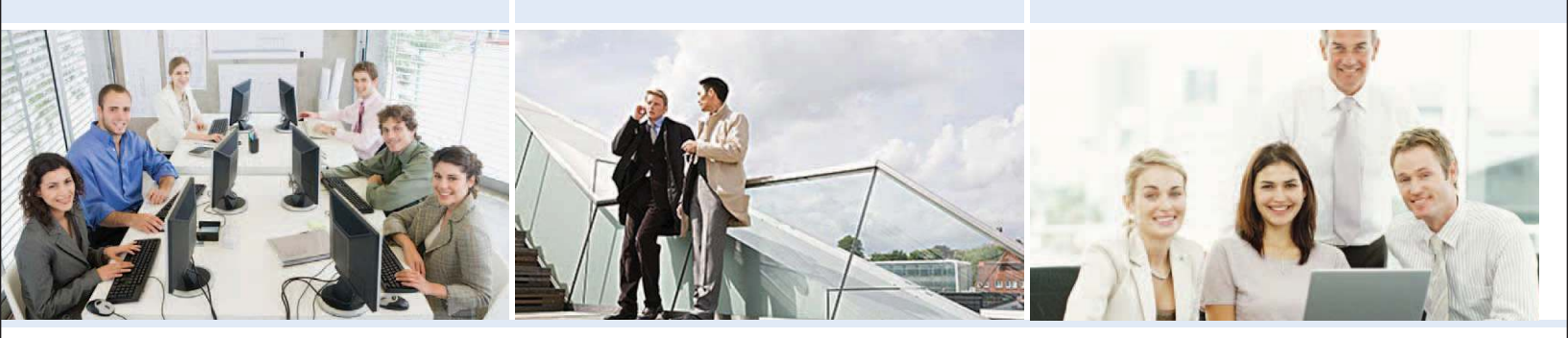
Hassle free setup, no configuration required

Innovative Green Technology saves power up to 80%