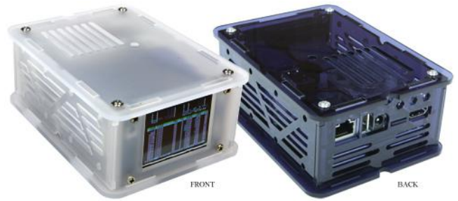
We have two different color choices. Smoky-Blue and Smoky-White. Laser cut acrylic enclosure

It gives you a high performance network storage.